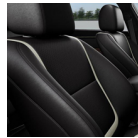
16x12 way Seats