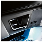
Meridian 380W Sound System